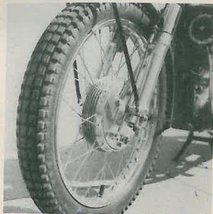
Front wheel shot illustrates the handsome design of the front section. Note the full width hub.

Twin" proved to be more than ample both in the dirt and on paved surfaces. It could be noted at this point that the tires fitted to our Twin certainly were not expressly meant for stopping on paved surfaces. In spite of this, the Matchless managed to turn in a commendable job of bringing man and machine to a screeching halt.