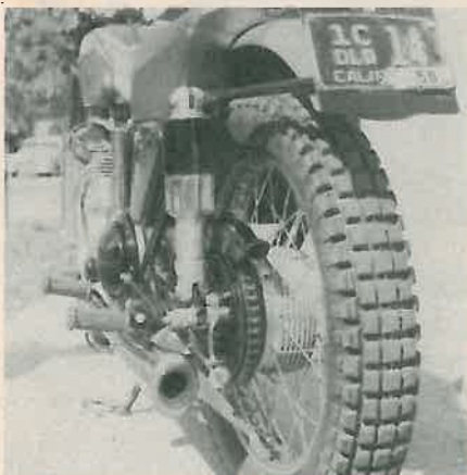
The rear section of the "Sport Twin" clearly shows the generously finned brake hub, rear shock position.

Oil to the overhead rocker assembly is supplied through a metered by-pass, after which it drains into the camshaft tunnels, and surplus lubricant overflows into the timing gear case. For 1955, the lubrication of the overhead gear has been improved. A pre-determined oil level builds up in the timing case and the camshaft tunnels for adequate lubrication of gears, cams and cam levers. Surplus lubricant overflows into the crankcase and sump where the sea-