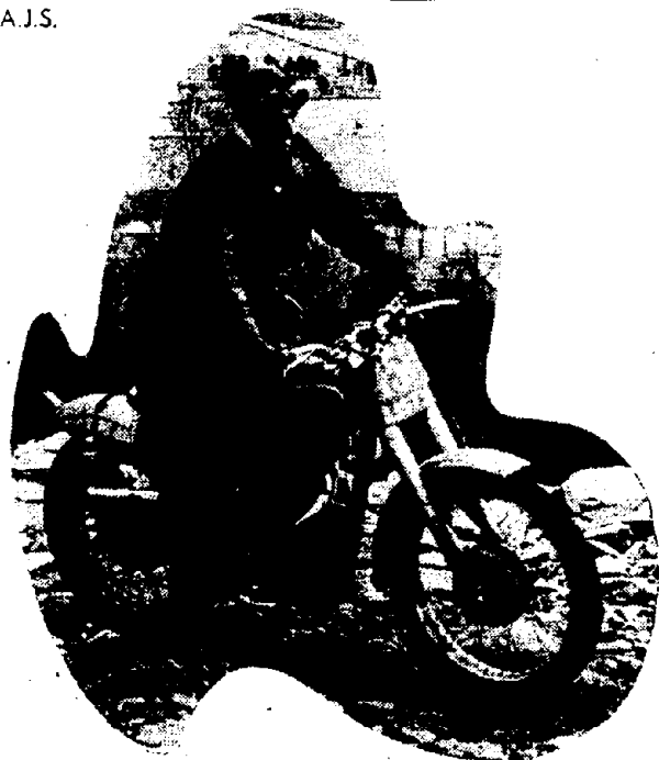
"The Motor Cycle" photograph