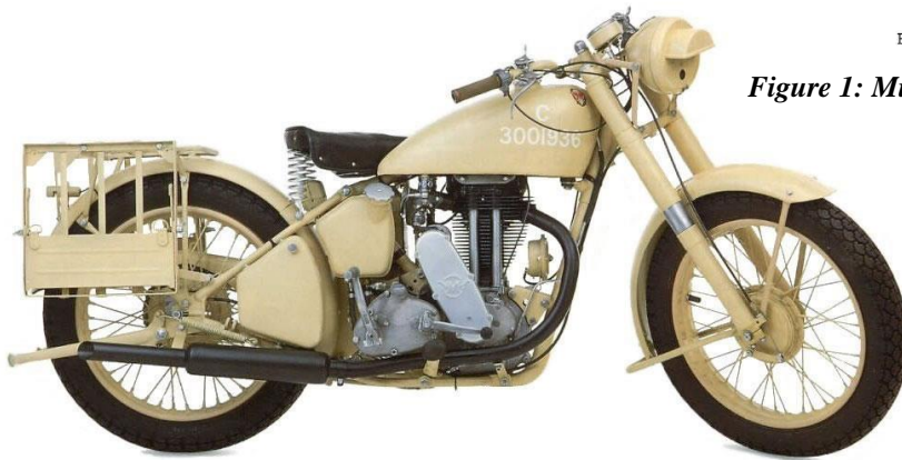
Matchless G3L Army 1941

(these are all 350cc Matchless produced for the war office) 41/G3L-WD, C 294-C 9506 & 9841,