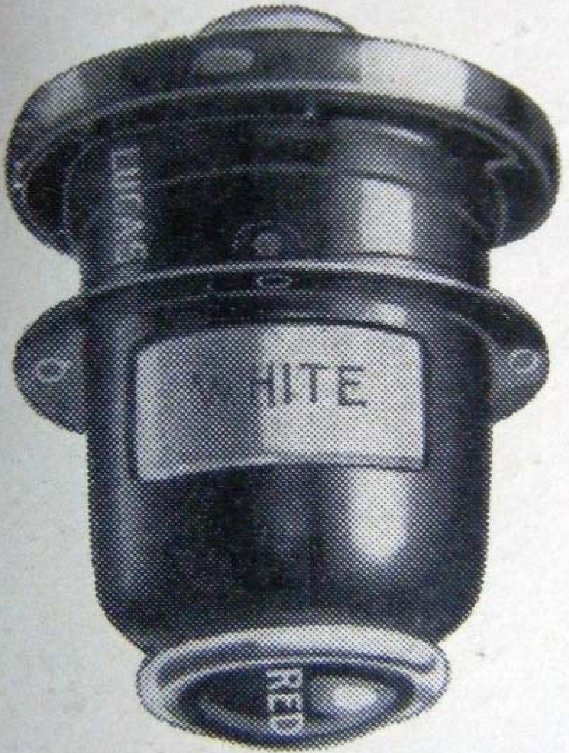
TAIL LAMP NO. MT110