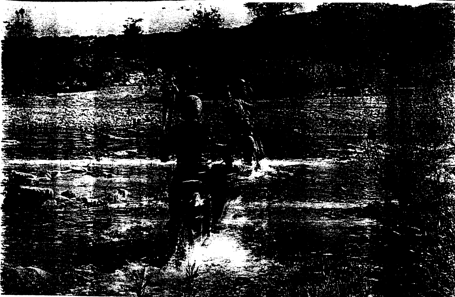
MOJAVE RIVER was crossed twice, keeping this desert and mountain enduro from becoming a "dry run" (if you'll excuse the pun!)